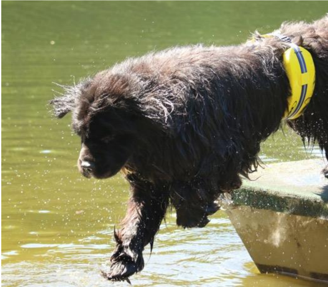
Figure 3 I got this, 05/31/20

Yeh! It is Summertime which means it is water training time with our Newfs, it is the best time of the Year and our Newfs Love it, So let's start with our first practice on May 31, 2020. Please notice that we practice with Masks and Social Distancing.