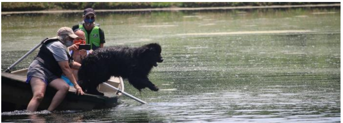
Figure 19 I am leaving now 06/20/20