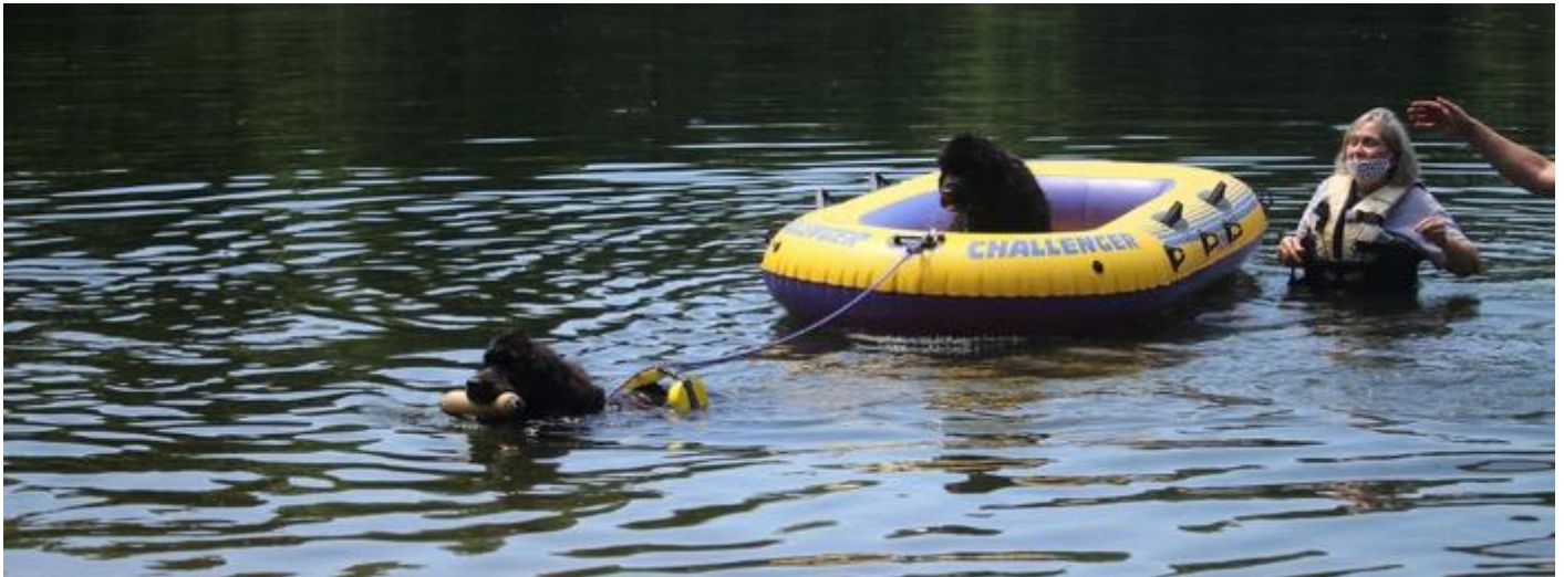
Figure 17 I got you Breezy, you were floating away 06/14/20