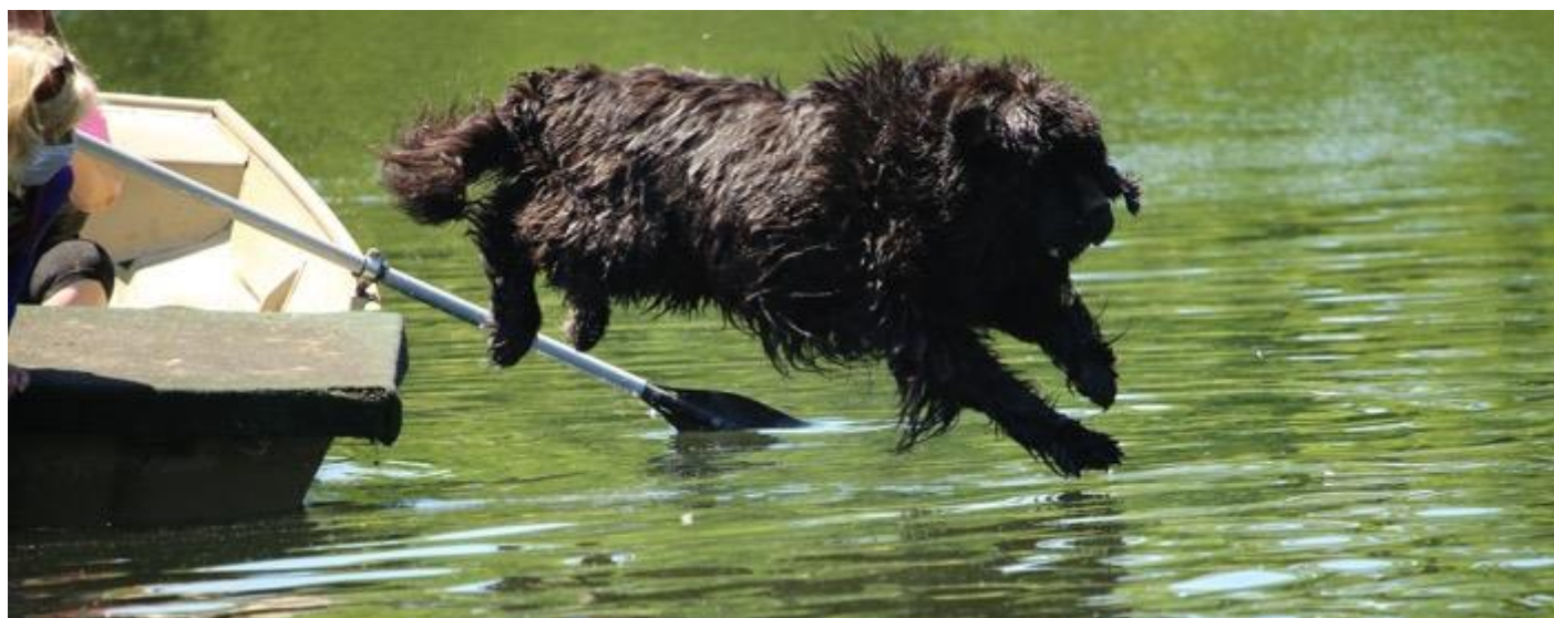
Figure 7 I am on my way to help you 05/31/20