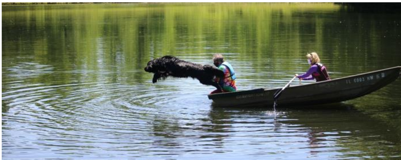
Figure 6 Abby retrieving paddle 05/31/20