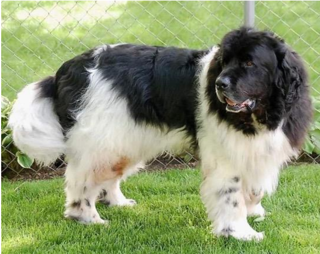
Figure 2 This is Cougar, he truly is a handsome young man.