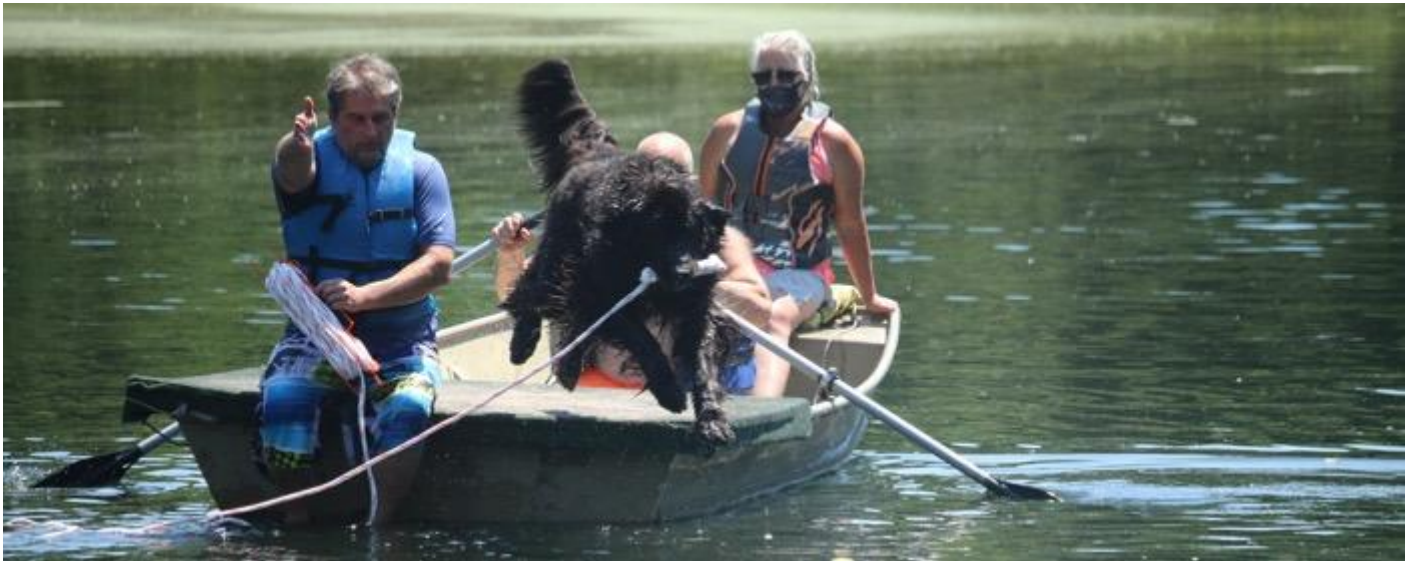
Figure 11 I got this, and I am on my way 06/14/20