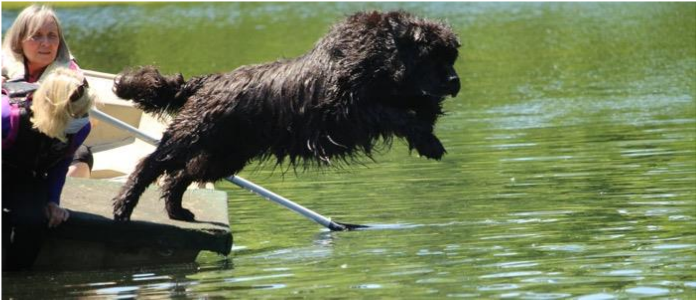
Figure 8 I will get them mom 05/31/20