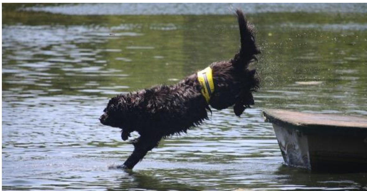
Figure 15 Hey, this water is cold 06/14/20