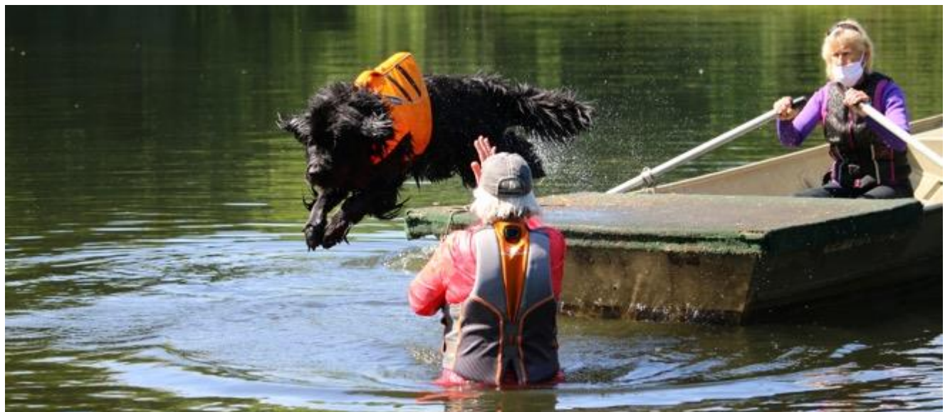
Figure 10 Hey Mom Am I high enough 05/31/20