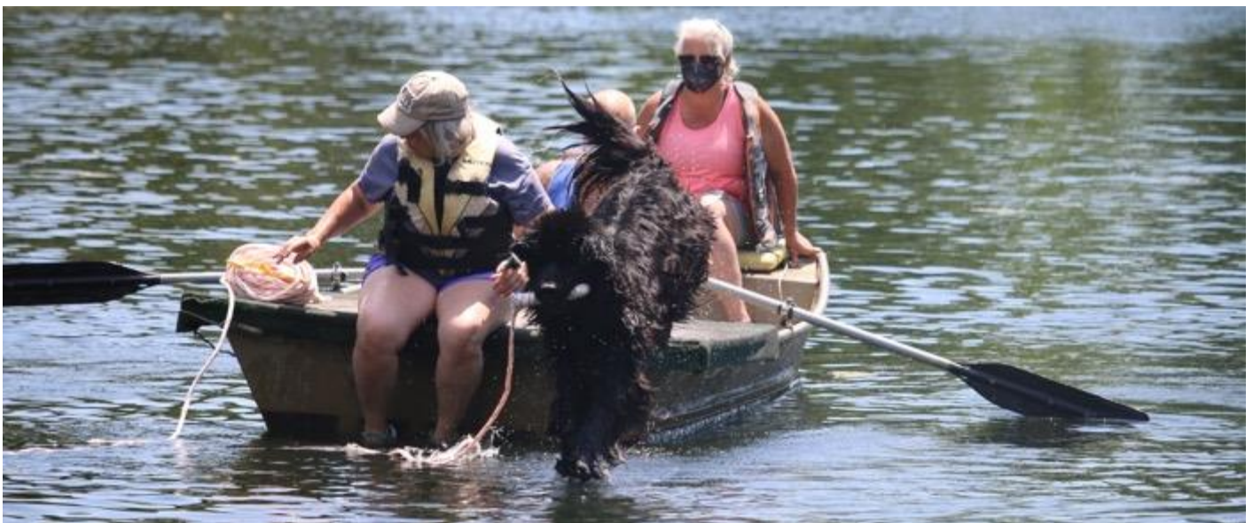
Figure 13 I got the rope mom; I am going to shore 06/14/20