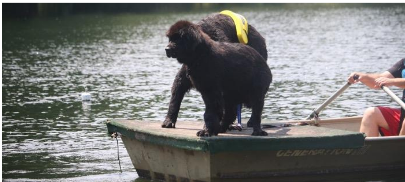
Figure 22 Puppy boat ride 06/20/20