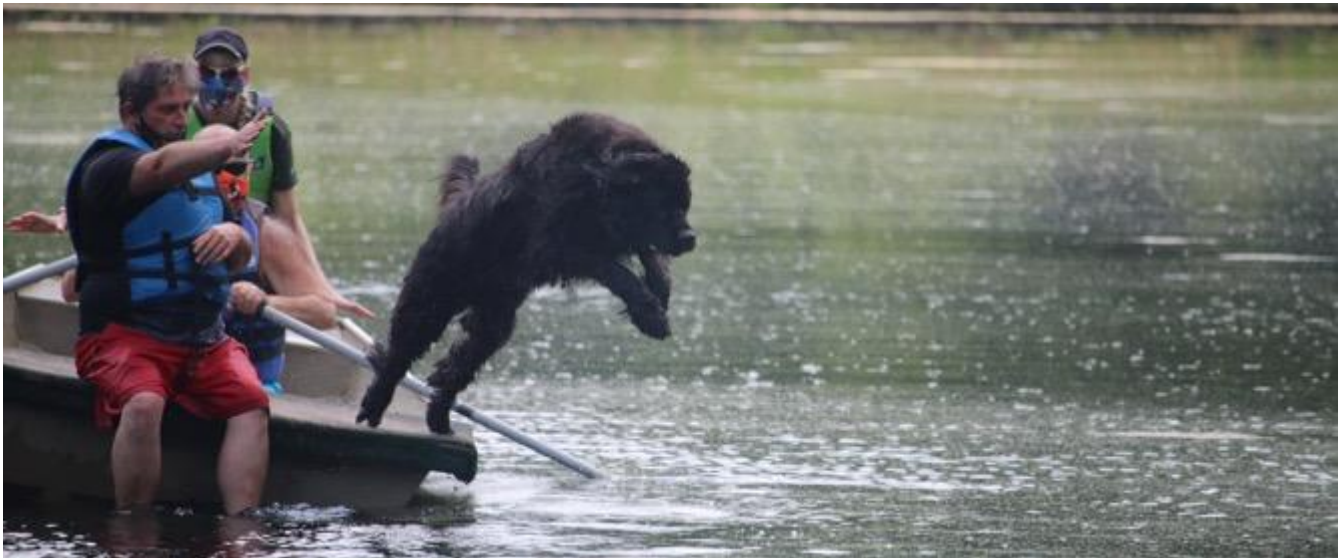
Figure 18 Abby in takeoff mode 06/20/20