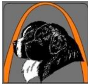
River King Newfoundland Club