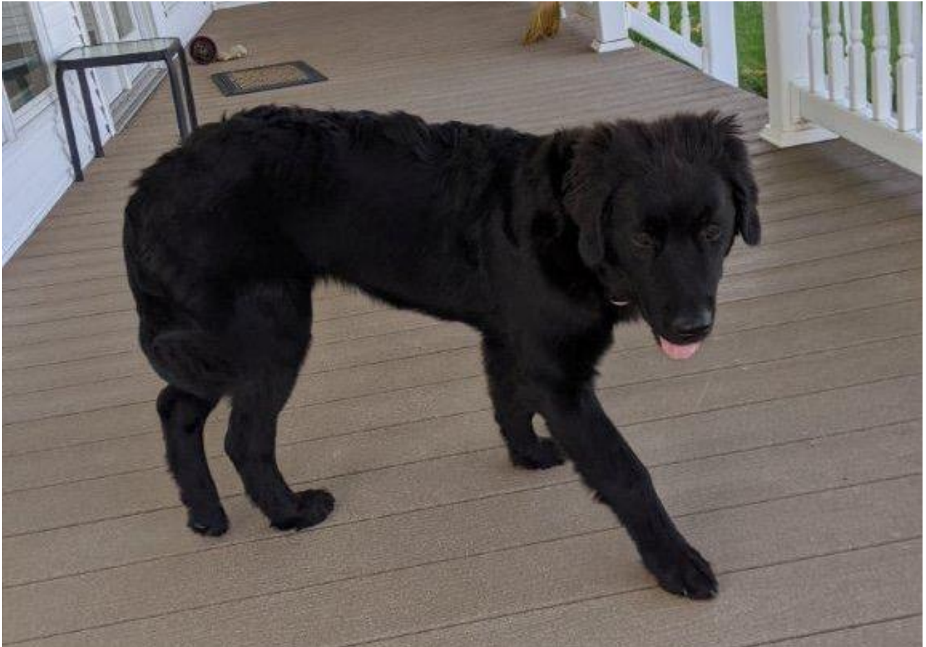
Figure 1 This is a picture of Mica.