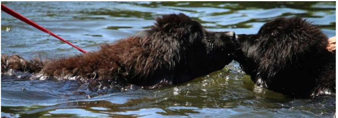
Figure 9 Puppy Time 05/31/20