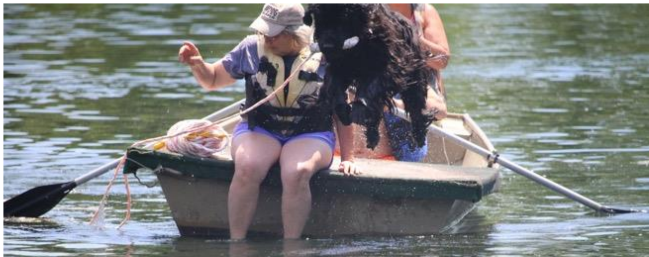
Figure 14 Super girl in takeoff mode 06/14/20