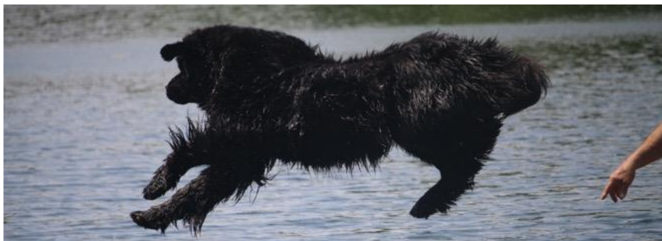
Figure 21 I am in flight, is it cold in there? 06/20/20