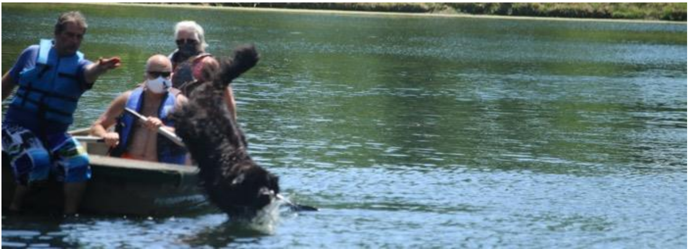
Figure 12 I am on my way to help, please call me 06/14/20